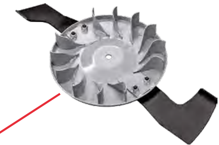
Blades are fitted with a fan

The cutting deck is fitted with a hydraulic cleaning system in the loading chute. It is activated automatically each time the grass collector is emptied.