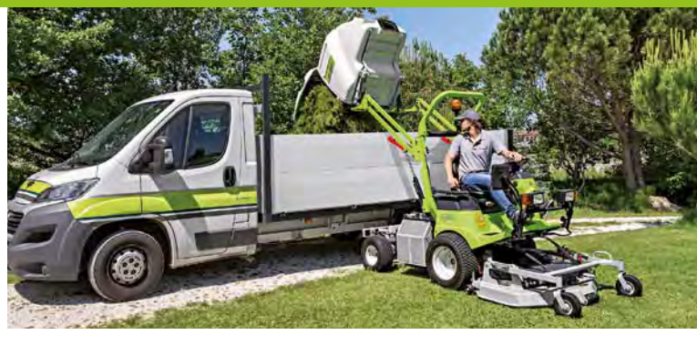
The hydraulic services of both the grass-catcher and cutting deck are activated via practical levers fitted with safety system devices and are located on the dashboard. It is very easy and quick to empty grass into a truck and also easy to raise the cutting deck when negotiating obstacles or kerbs.